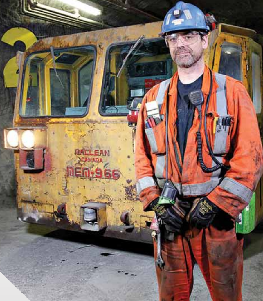
An operator standing in front of a MacLean Boom Truck, still in active service after two decades underground.